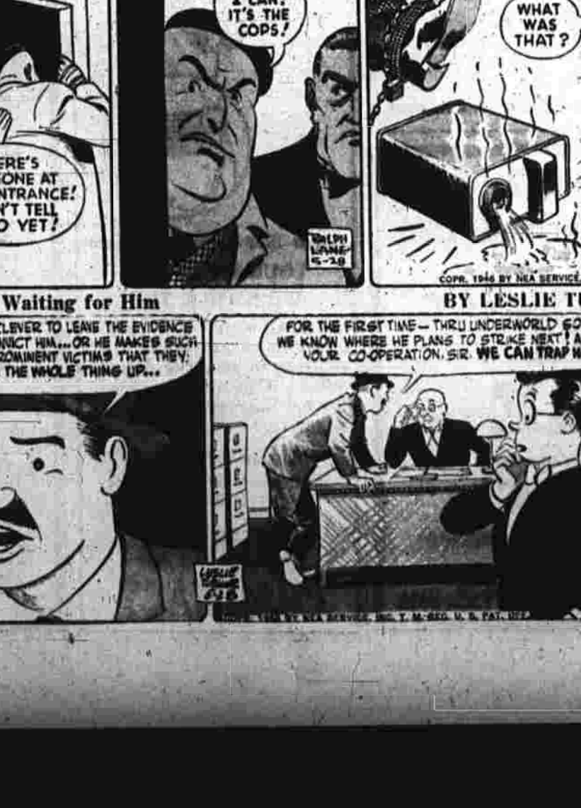
"I make a bold move."