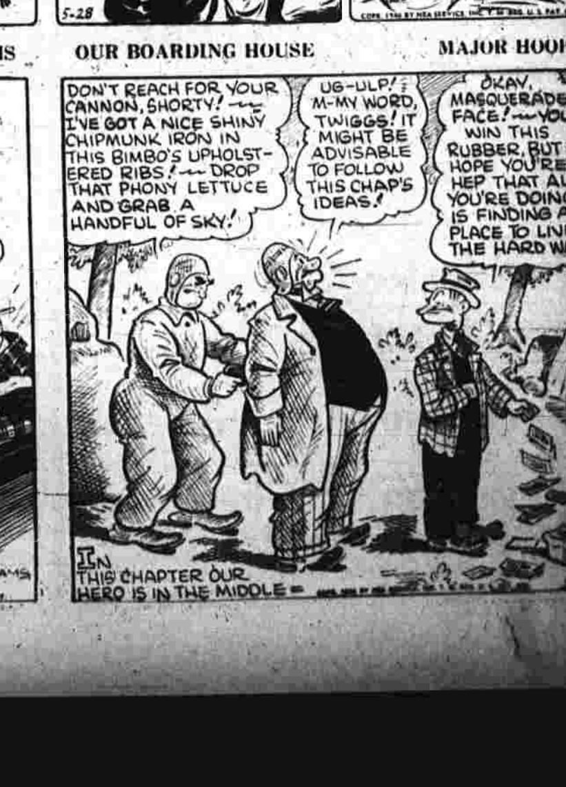
"I make a bold move."