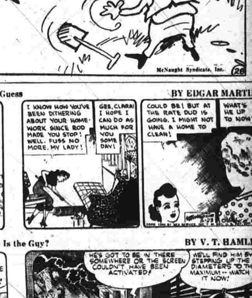
"I make a bold move."