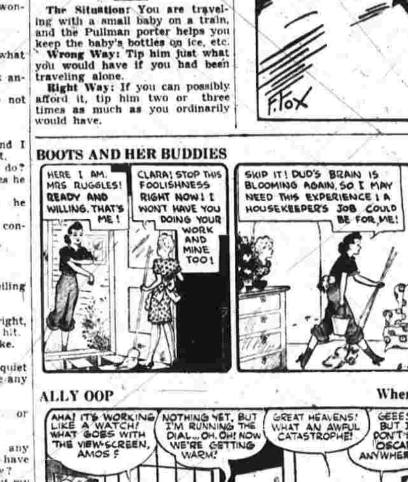
"I make a bold move."