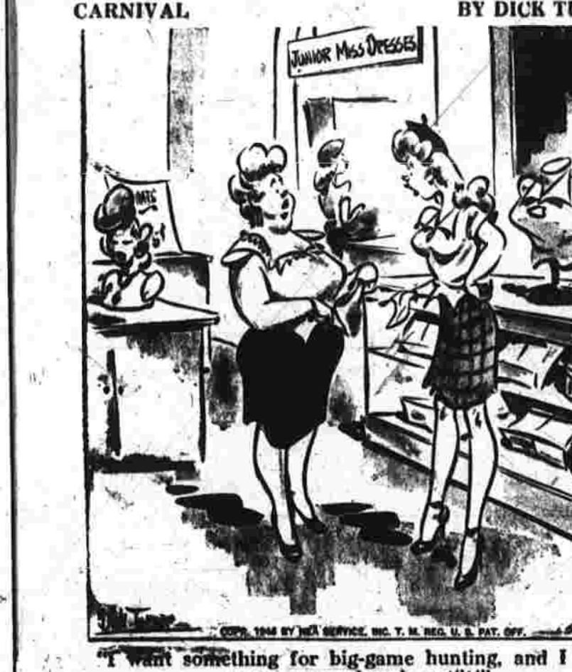
"I want something for big-game hunting, and I don't mean an explorer's outfit!"