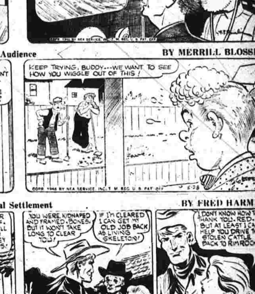
"I make a bold move."