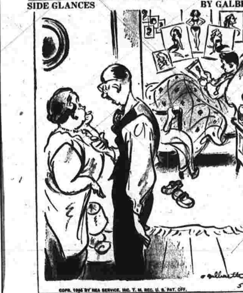
"Yes, but whenever I start to talk to him about the things in life that really count, he grins and says, 'I'm way ahead of you, Pop—and I get embarrassed'."

I KNOW HOW YOU'VE BEEN DITHERING ABOUT YOUR WIFE. SHE'S A WORK SHACK BOSS. SHE'LL PUNISH YOU MORE! MY LADY!