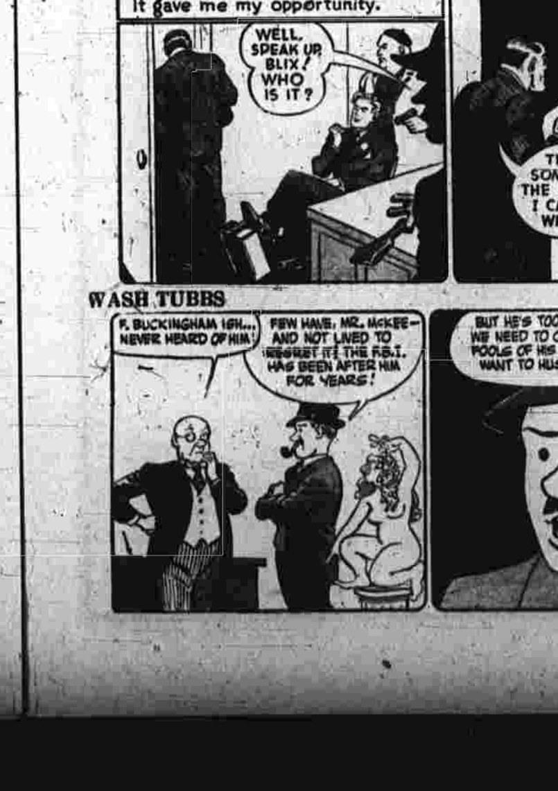
"Someone else was at the door now. It gave me my opportunity."